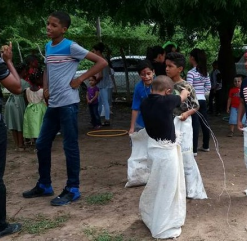
Family Day Fun!